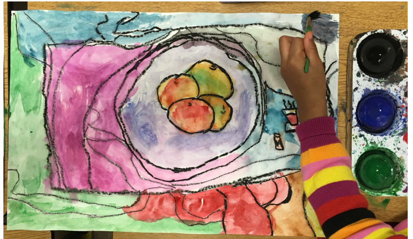
Top left: Collograph Landscape Print (3 rd grade). Bottom Left: Mondrian Collage (K). Top Right: Apple Still Life (1 st grade)